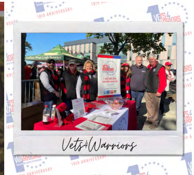
10 Year Anniversary Graphic