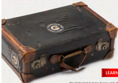
Ben Goldwater's Suitcase, Europe, early 20th century

Stories of Survival OBJECT · IMAGE · MEMORY