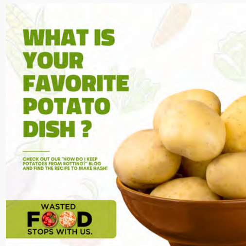
Social Media Graphic