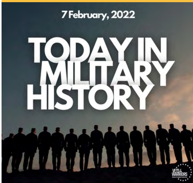
Social Media Graphic

Vets4Warriors has been supporting the entire military community; veterans, active service members, and military families; from those who have just put on a uniform to the caregivers of veterans who have long stopped wearing a uniform.