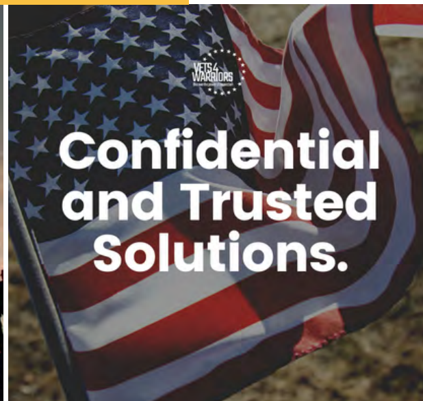
Facebook Retargeting Graphic