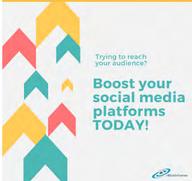
Social Media Graphic