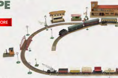
Ralph Reibbeck's Train Set Germany, 1938

Stories of Survival OBJECT · IMAGE · MEMORY