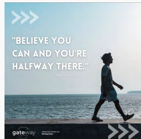
Social Media Graphic