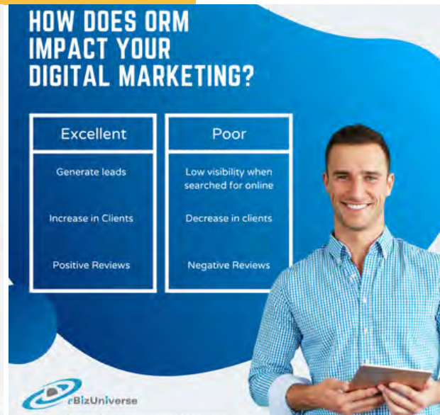
Social Media Graphic