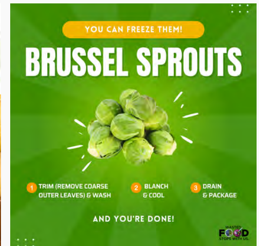
Social Media Graphic